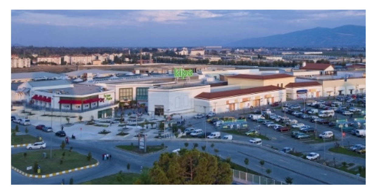
FORUM AYDIN Center / Aydın Multi Turk Mall – ERBA İnşaat AVM (80.000m<sup>2</sup>) Mechanical Installation Control.