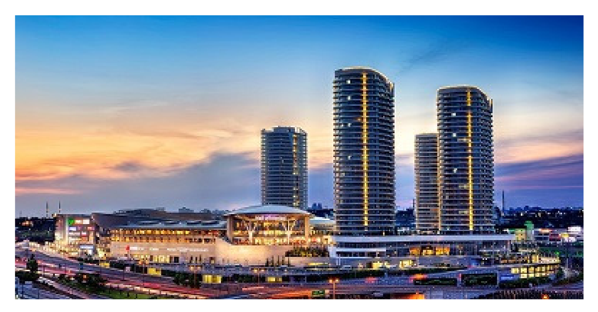
MALL OF ISTANBUL İkitelli / İstanbul Torunlar GYO Shopping Mall and Residence (750.000m<sup>2</sup>) Mechanical Installation Progress Payment and Final Account.