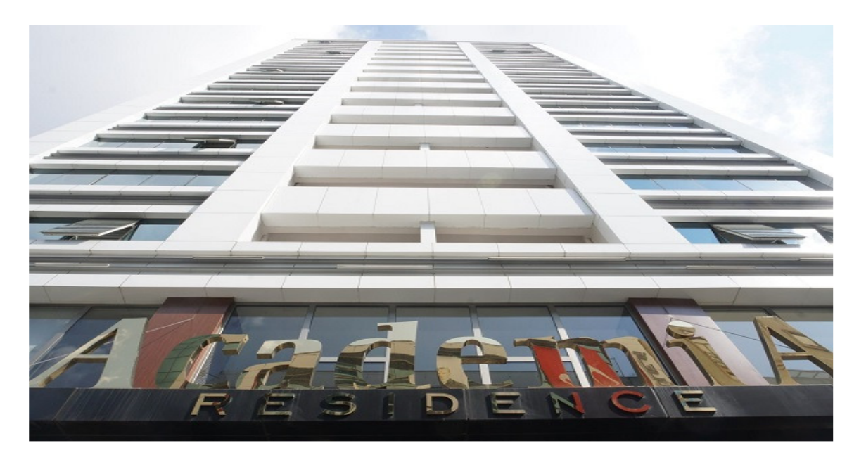
ACADEMIA RESIDENCE Kağıthane / Istanbul Petra Yapı Residence (18 floors – 108 flats) Mechanical Installation Control and Renovation.