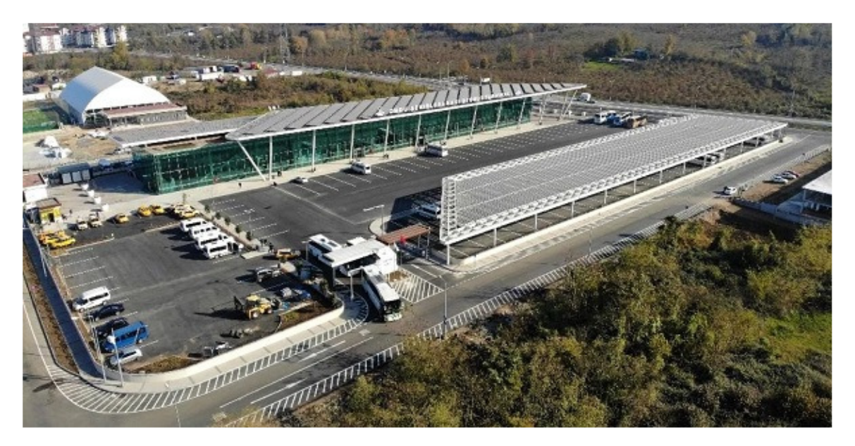
ORDU TERMINAL Merkez / Ordu OBB Gothic Architecture Terminal Building (4.000m<sup>2</sup>) Heat Pump Mechanical Installation Projects.