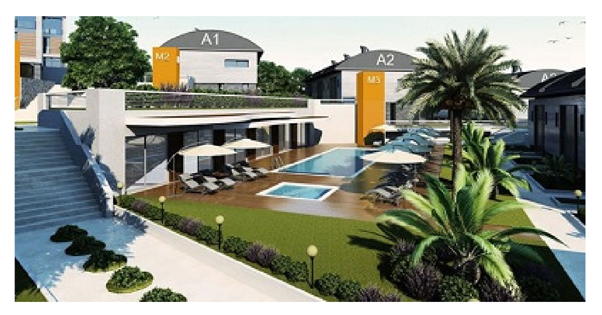
TERRACE HAYAT Zekeriyaköy / Istanbul İNANLAR CONSTRUCTION Villa (30.000m<sup>2</sup>) Mechanical Installation Renovation Projects.