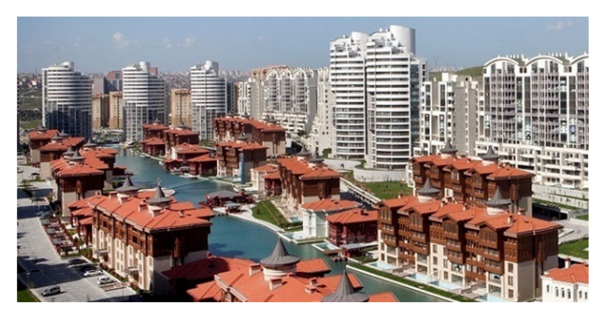
BOSPHORUS CITY Halkalı / İstanbul Sinpaş GYO Cihan Cons. Residence (3,000 flats) Mechanical Installation Site Supervisor.