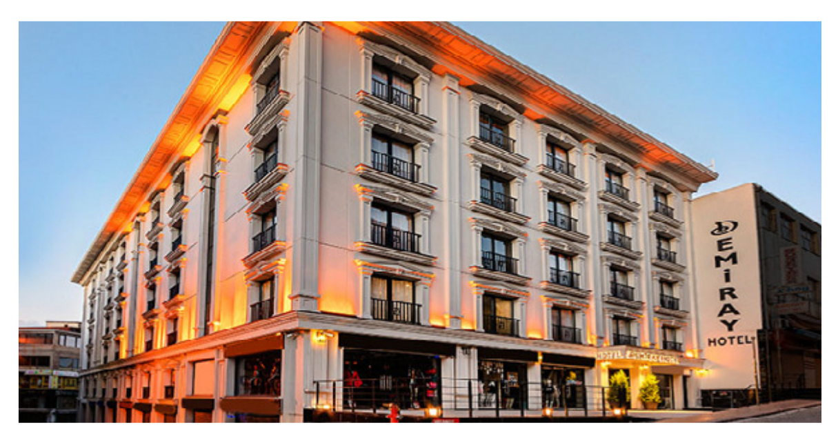
DEMİRAY (5*) HOTEL Sirkeci / Istanbul (120 rooms) Mechanical Installation project and contracting.

FINDIKKULE RESIDENCE Konuralp / Düzce (19 floors - 121 flats) Reference Yapı Fire Installation Projects and Contracting.