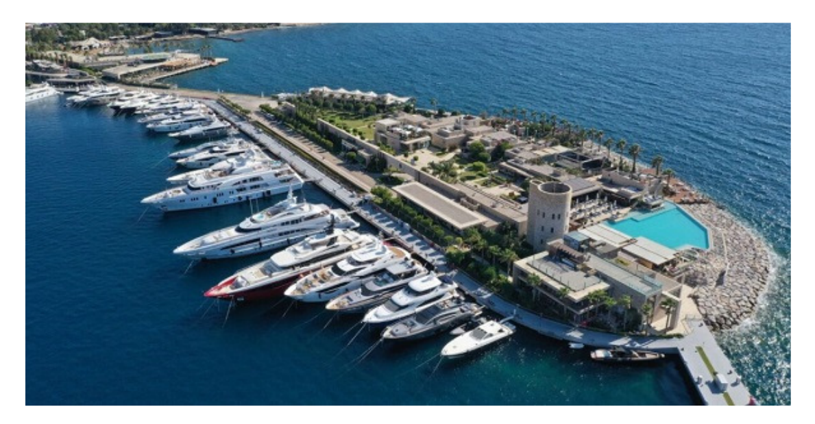
YALIKAVAK MARINA / BODRUM Fire installations and ventilation systems improvements commitment.