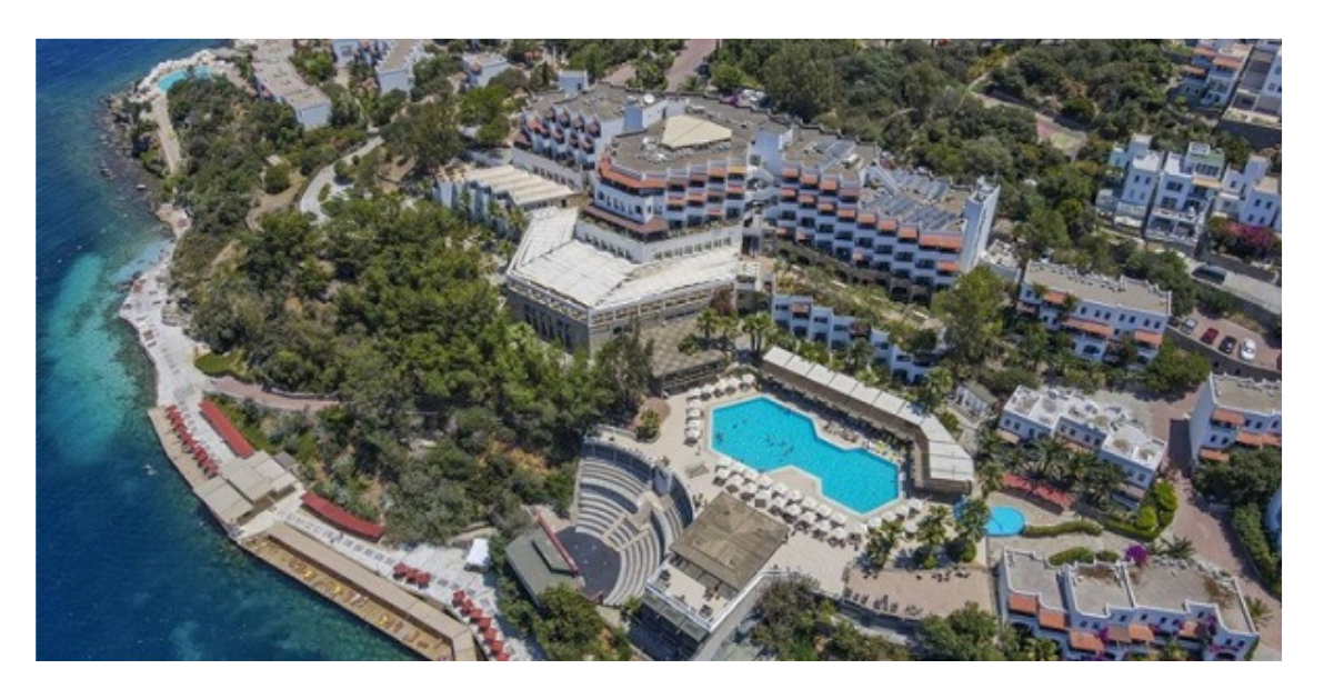
HILL SIDE HOTEL Gündoğan / Bodrum / MUĞLA Alarko Holding Infrastructure steel pipe (3.000 m.) manufacturing.