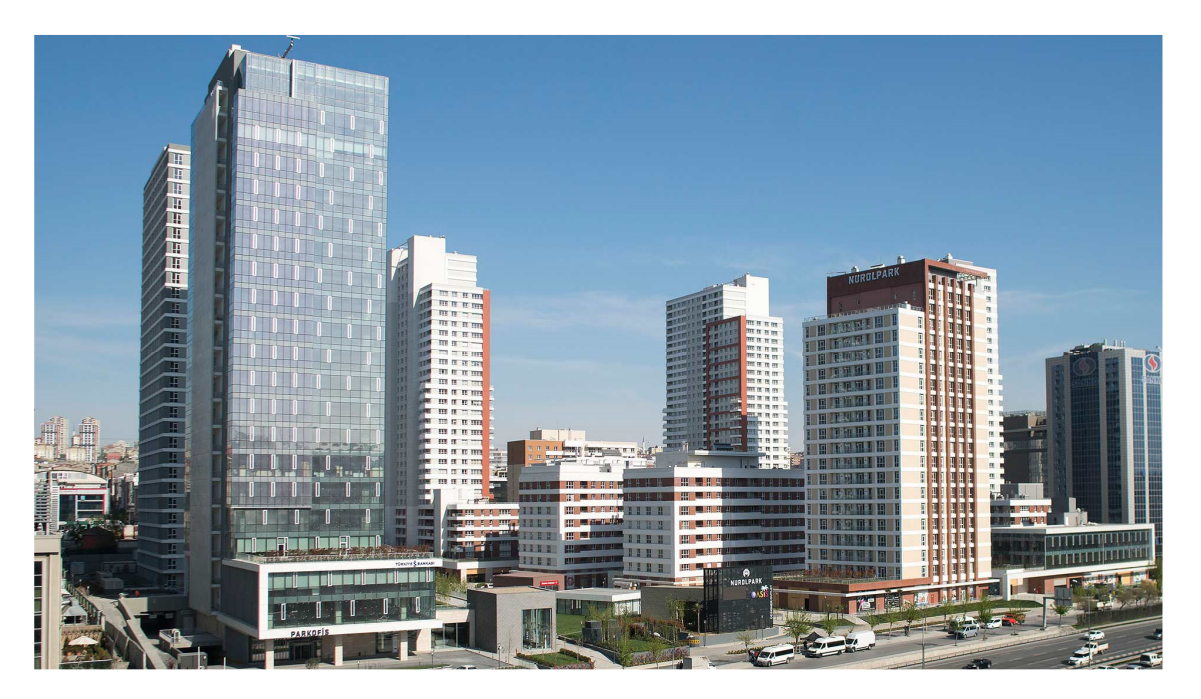
NUROL PARK EOFIS FLOOR (80 offices) Başakşehir / İstanbul Nurol GYO Mechanical Installation Project and Contracting.